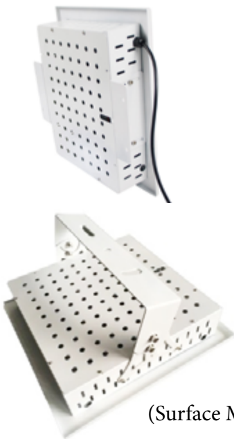
(Surface Mounted Bracket)